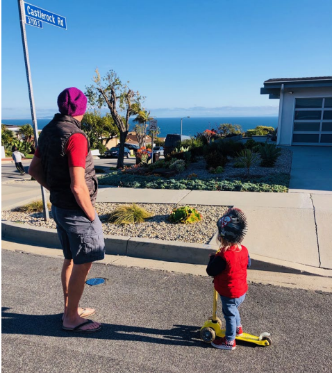
Bode and Dad spending quality "guy" time together